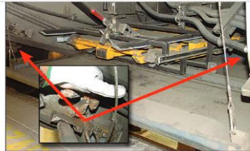
Figure 1-12 – Lower storage compartment latches and safety cables