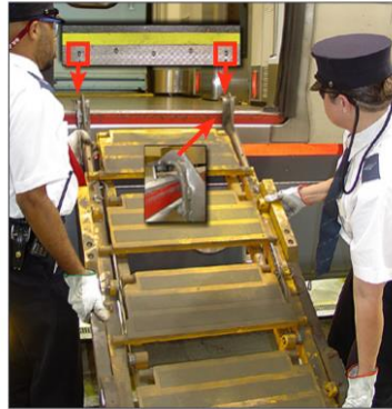
Figure 1-14 – Secure folding stairs to car body