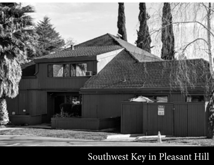
Southwest Key in Pleasant Hill

While these settings are not as restrictive as Yolo or BCFS, children detained in shelter care facilities live regimented lives and face the possibility of being “stepped up” to more restrictive placements if they are “disruptive” or if they exhibit self-harming behaviors. The physical spaces where children in shelter care live are not locked, but most have an institutional feel, featuring barred windows and cement walls that surround circular or rectangular layouts with a central office, lodge, or hallway utilized mostly for observation of children by staff members. The only outdoor space accessible to children at Casa San Diego is a cement courtyard. At Casa Lemon