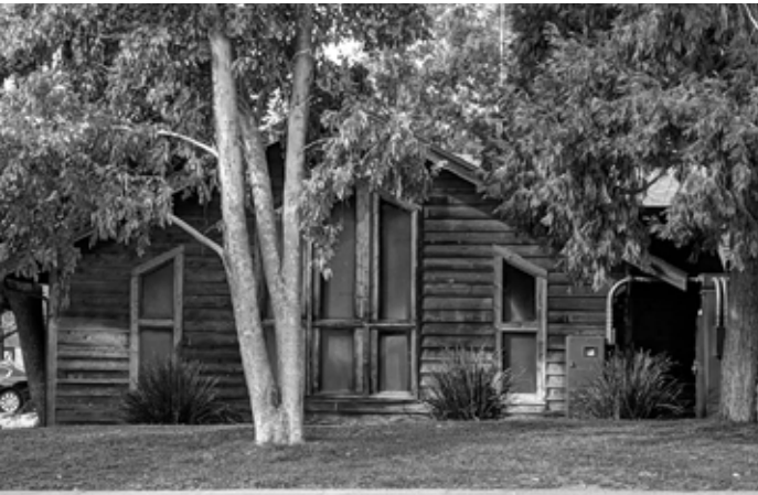
BCFS staff secure facility in Fairfield, CA

DRC spoke with 13 children at BCFS over the course of two visits. One teenaged